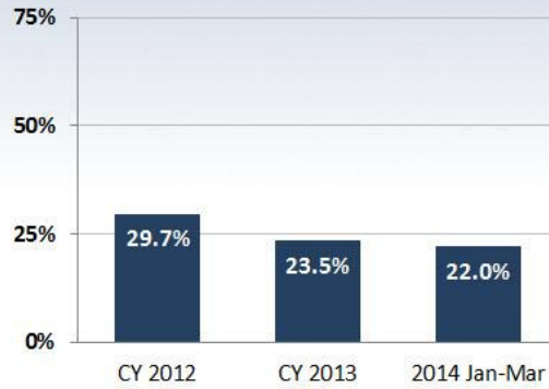
In-Home Abuse/Neglect Investigations Open Longer than 90 Days

Investigations open longer than 90 days are continuing to trend downward* as staffing levels improve.