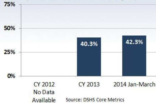
Facility Abuse/Neglect Investigations Open Longer than 90 Days (Resident and Client Protection Program)